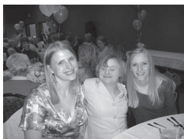
It was a girls day out for the lovely Wojarnowicz sisters