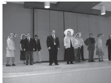
The Villagers entertained in their Easter bonnets