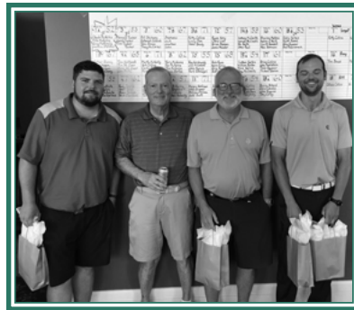
Pictured is the first place team from McNellis Insurance